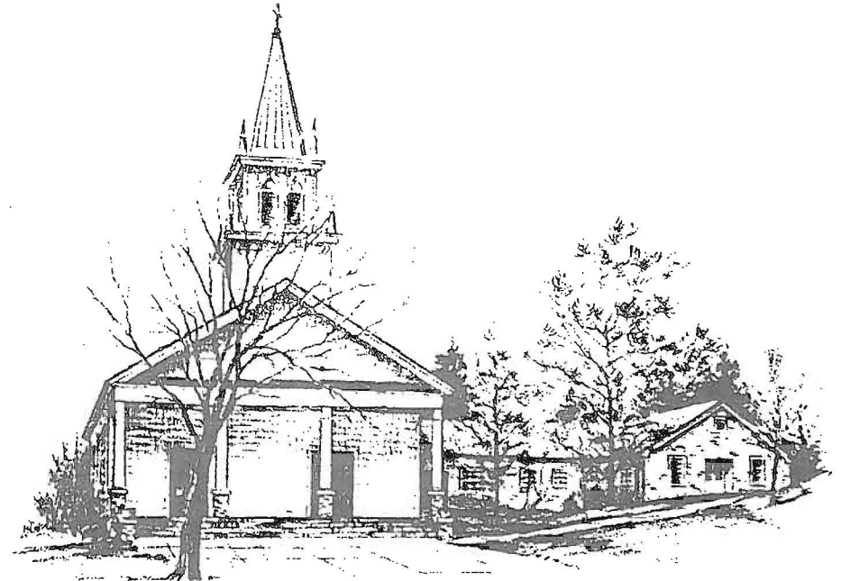
Seale United Methodist Church Seale, Alabama